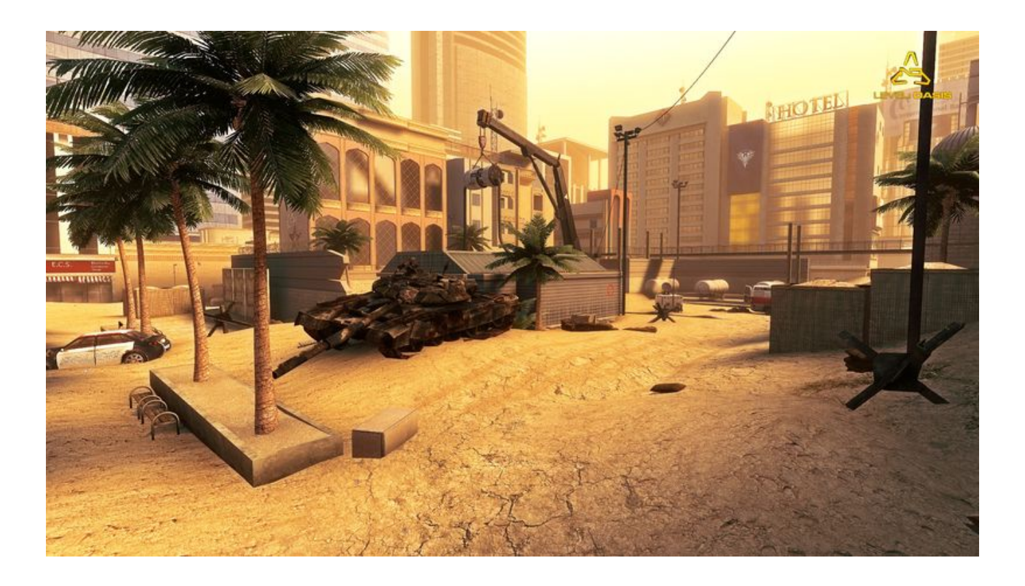
Download ->->-> http://bit.lv/2NFX65w